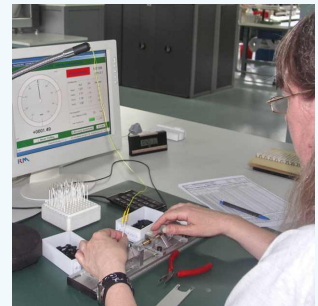
adjustment of sensors, PC-controlled

You will receive exactly the right sensors for your application from us. In many cases we fall back on our extensive modular system. We also implement completely new developments for you (OEM). With our own tool shop, plastic injection molding shop and cable assembly, we are ideally positioned for you.